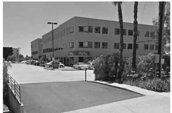
Entrance from Woodlake driveway