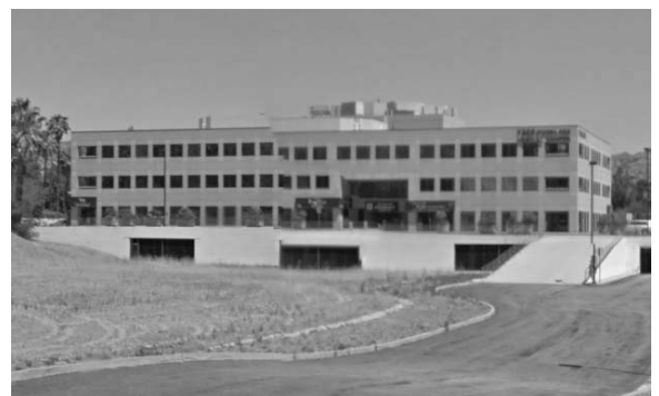
Entrance from Sherman Pl. driveway